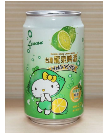
Marketing beer to women in Taiwan.

Voluntary codes, guidelines and responsible use campaigns are insufficient and not a substitute for legally enforceable measures.