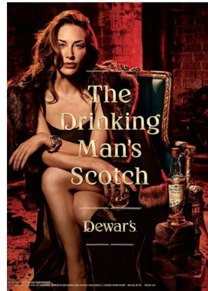
Alcohol may have an even more negative effect on women’s health.

Alcohol advertisements stimulate and encourage alcohol consumption, and attract new customers by targeting two groups in particular—women and young people.